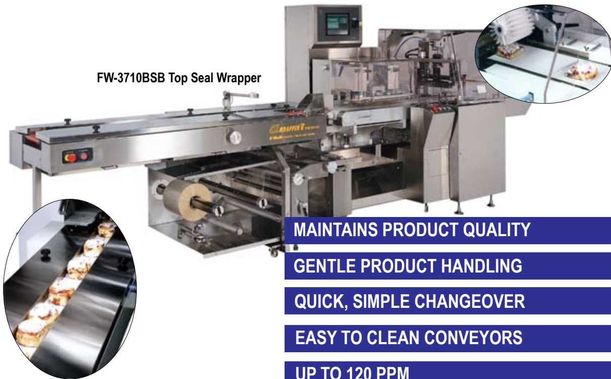
FW-3710BSB Top Seal Wrapper