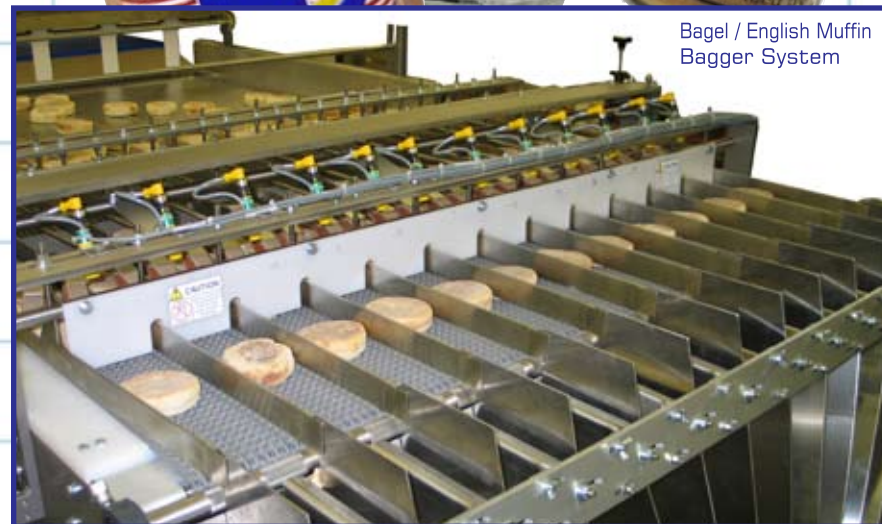
Bagel / English Muffin Bagger System