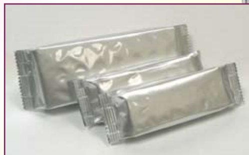
Form Fill & Seal Machine